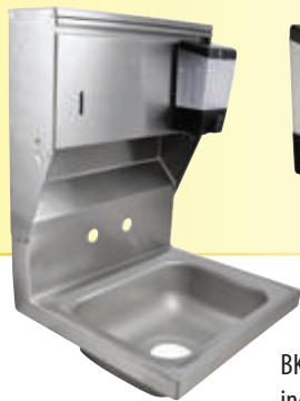
BKHS-W-1410-4D-TD includes Towel & Soap Dispenser