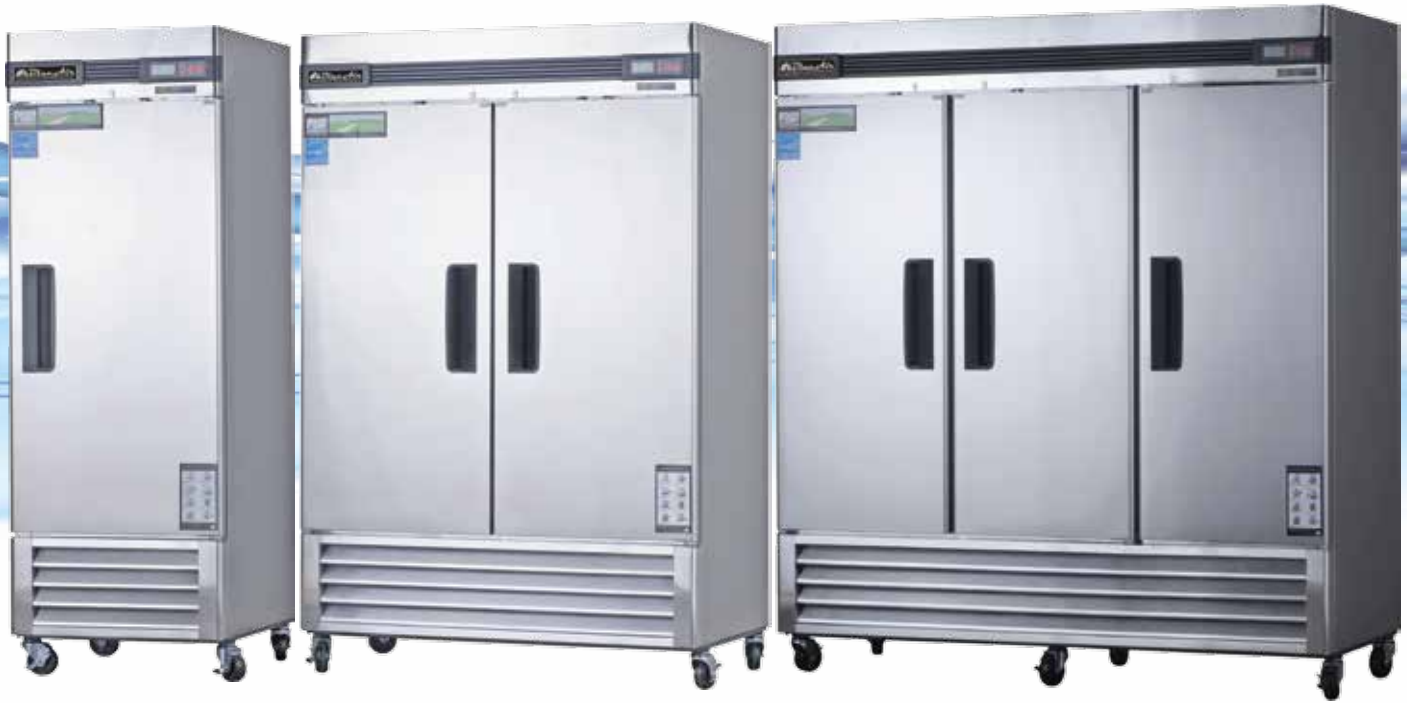
BASR1 / BASF1