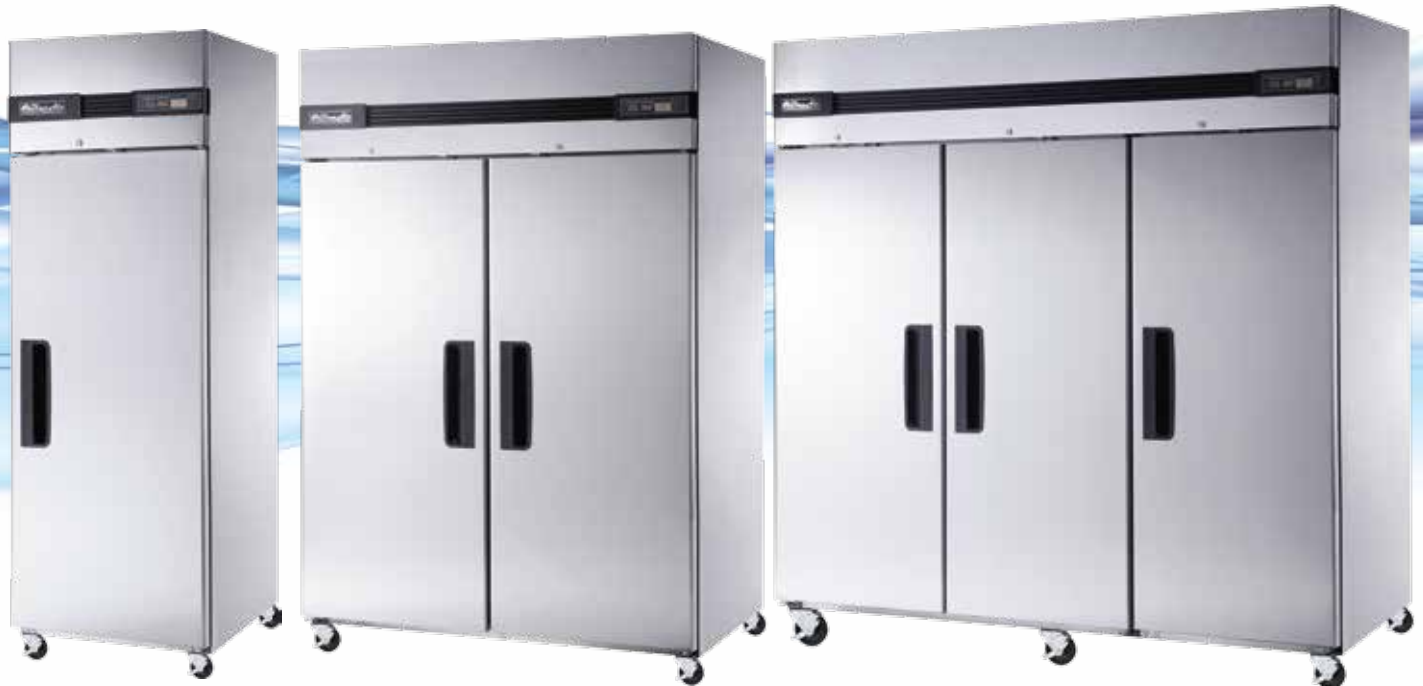
BSR23T / BSF23T