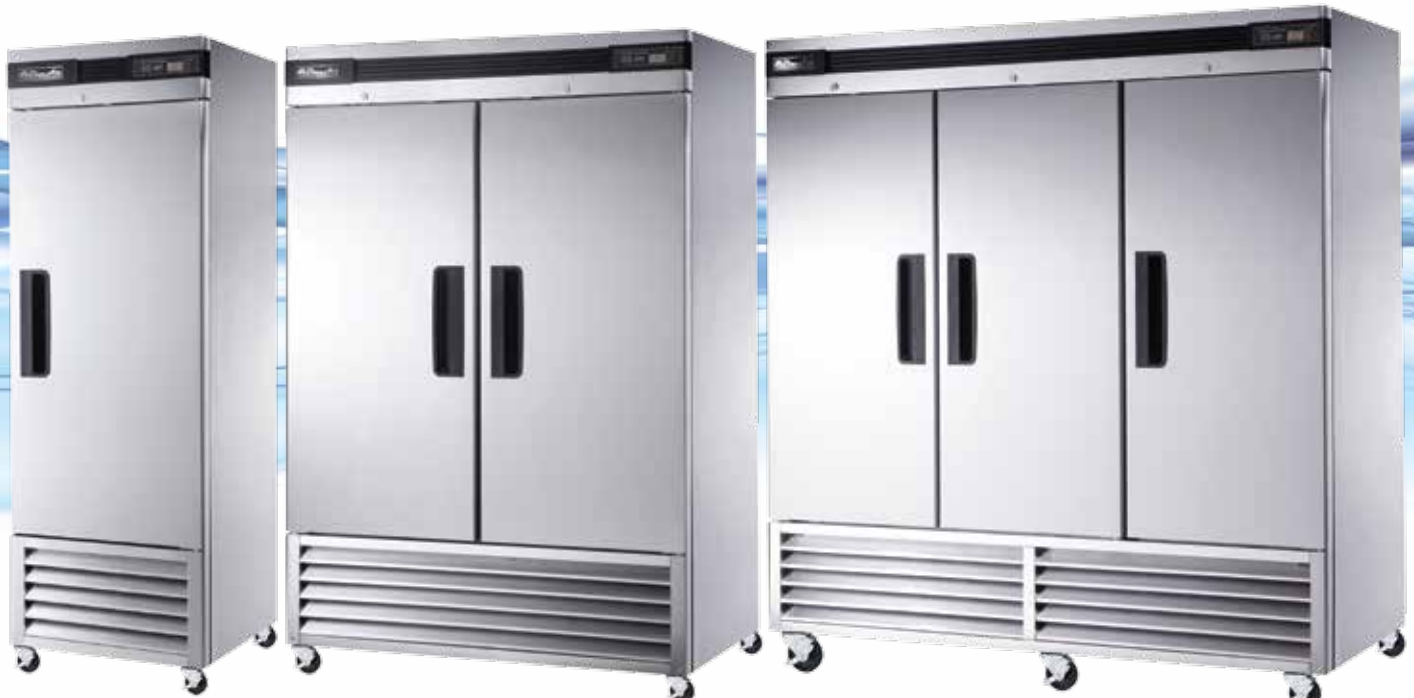
BSR23 / BSF23