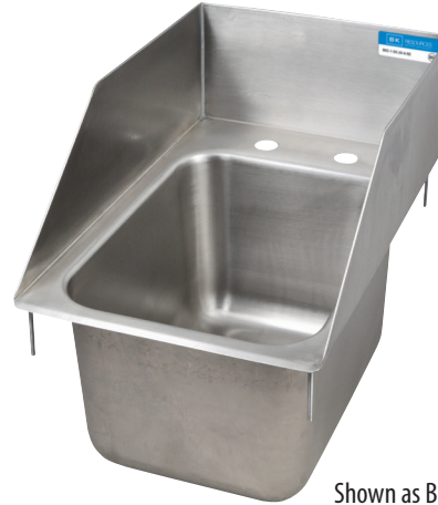
Shown as BK-DIS-1014-10-SS