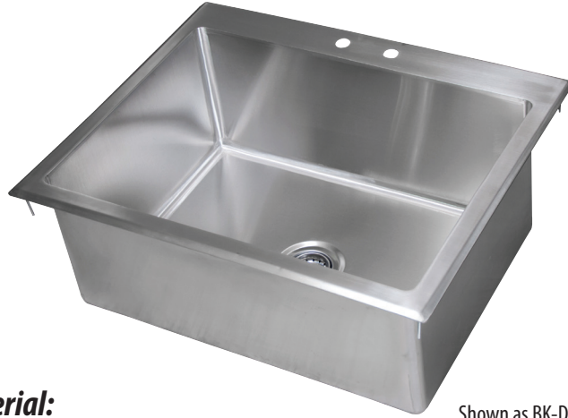
Shown as BK-DIS-2820