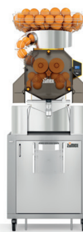
Speed Pro Self Service Podium

Whether you want to have the juice bottled and ready for your customers, provide them with a self-serve alternative, set it on a countertop or podium – our Speed Pro is the fastest and most robust juicing solution on the market!