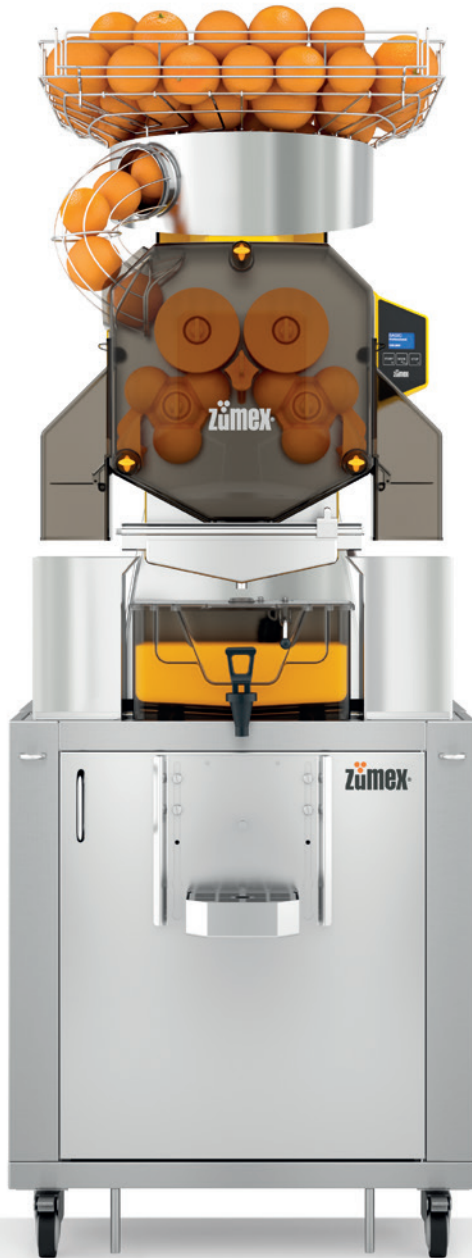
Speed Pro Tank Podium