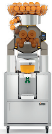
Speed Pro Cooler Podium