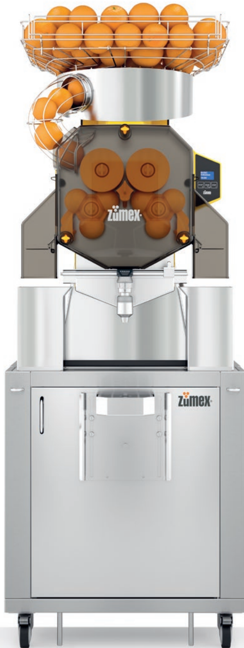
Speed Pro Self Service Podium