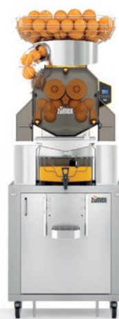
Speed Pro Tank Podium

Offer the best freshly squeezed juice to your customers and bring them a Life Essence experience.