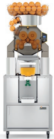
Speed Pro Cooler Podium