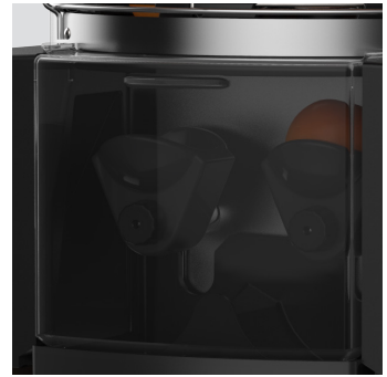
Smoky grey front cover

WARNING: This product can expose you to chemicals including bisphenol A, which is known to the State of California to cause cancer and birth defects or other reproductive harm. For more information go to www.P65Warnings.ca.gov