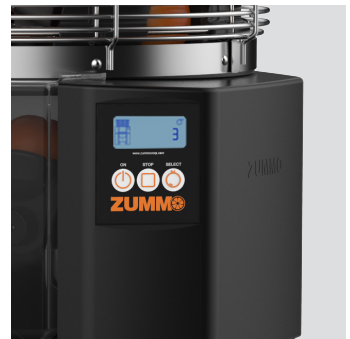
Higher juice extraction speed