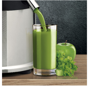
Smoothie direct to container