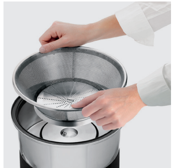
Easy to remove and clean