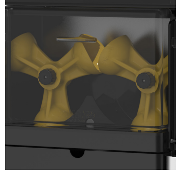
25 fruits per minute